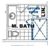
OPTION "A" 60" x 42" SHOWER W/ LINEN CLOSET