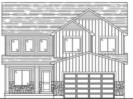
CRAFTSMAN A ELEVATION