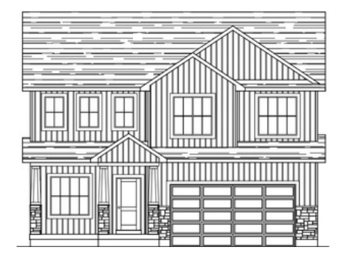
CRAFTSMAN B ELEVATION