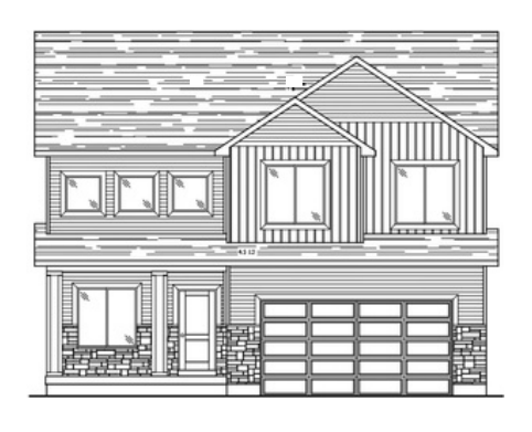
CRAFTSMAN A ELEVATION