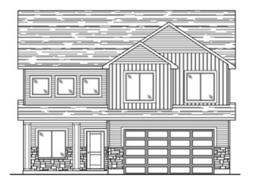
CRAFTSMAN A ELEVATION