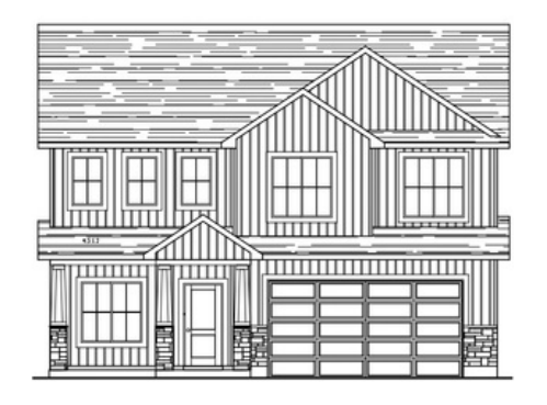
CRAFTSMAN B ELEVATION