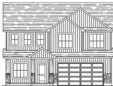
CRAFTSMAN B ELEVATION