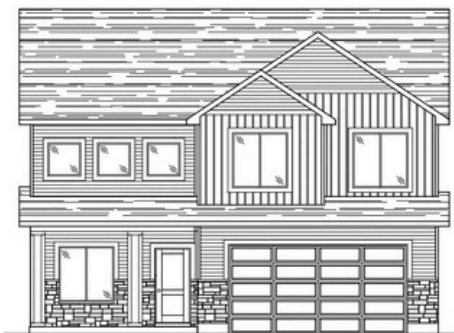
CRAFTSMAN A ELEVATION