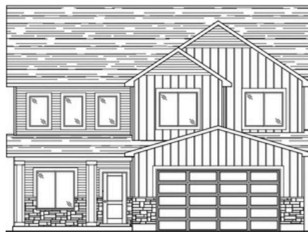
CRAFTSMAN A ELEVATION