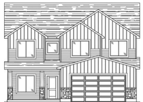
CRAFTSMAN B ELEVATION