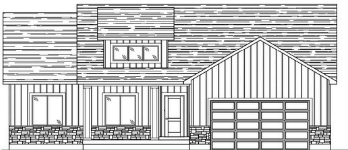
CRAFTSMAN A ELEVATION