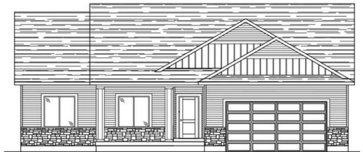
CRAFTSMAN B ELEVATION