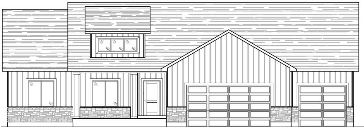
CRAFTSMAN A ELEVATION