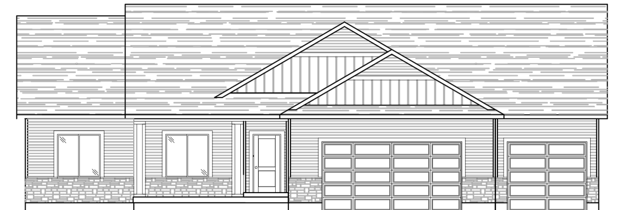
CRAFTSMAN B ELEVATION