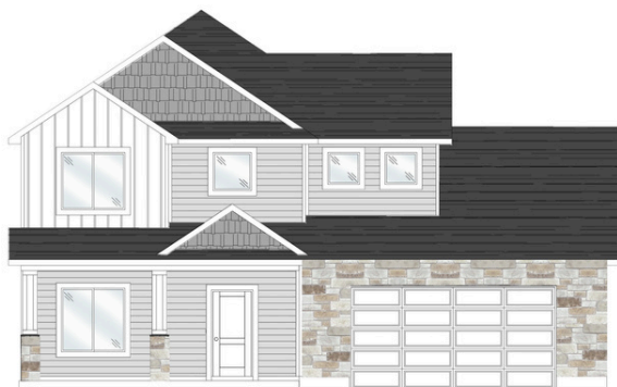
CRAFTSMAN A ELEVATION